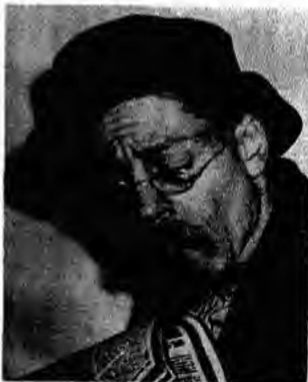
Four close-ups showing how completely different effects can be produced by changes in make-up and props. (See also page 5.)