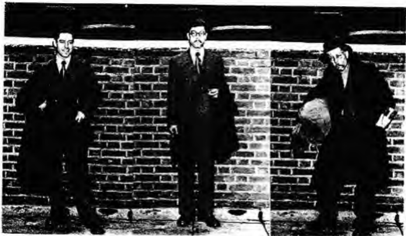
Three photographs showing how differences in height, weight, posture, character and age are achieved quickly.