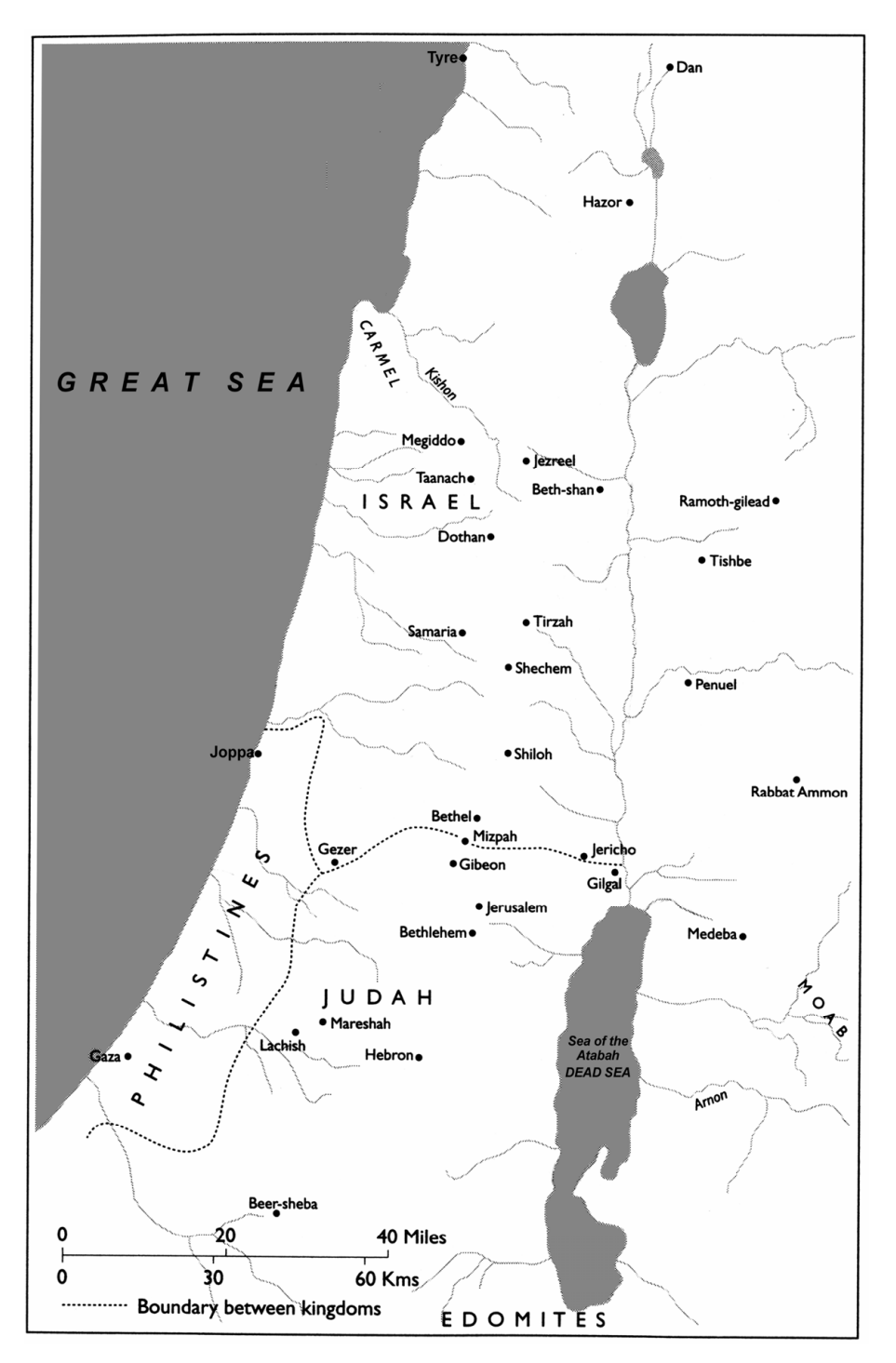
Map 1. Ancient Israel and Judah